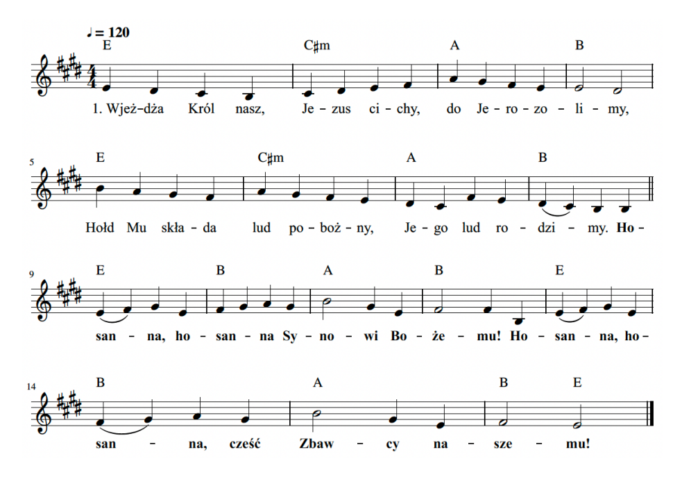
2. Brzmi: Hosanna! Witaj Zbawco! Wnijdź Błogosławiony! W imię Pańskie wchodzisz do nas! – brzmi na wszystkie strony. Hosanna, hosanna Synowi Bożemu, Hosanna, hosanna, cześć Zbawcy naszemu!

3. Bądźże tedy pozdrowiony, Boże nasz i Panie, Przyjmij od nas modły, hołdy, pobożne śpiewanie. Hosanna, hosanna Synowi Bożemu, Hosanna, hosanna, cześć Zbawcy naszemu!